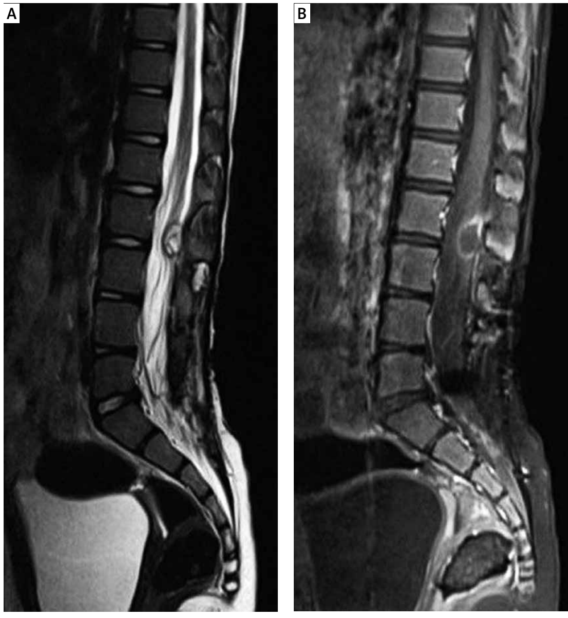
Figure 2 A, B. Sagittal T2 images and sagittal T1 images after contrast administration show prominent regression of the contrast enhancement and the size of the lesion, as well as the degree of cord expansion. Leptomeningeal enhancement was also decreased

cilli or culture examinations reveal the causative agent of the abscess.